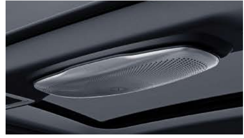
Burmester® high-end 3D surround sound system