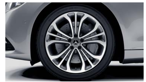
19-inch 15-spoke light-alloy wheels