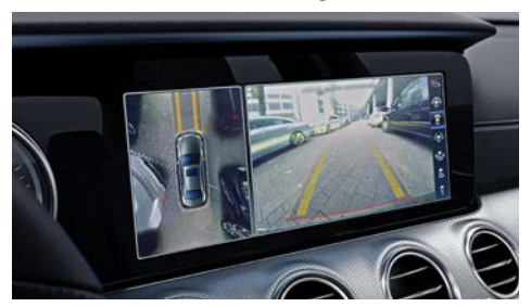
Surround view system